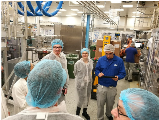
Pic. 1: Introducing the problem, Day 2 (08.10.19)