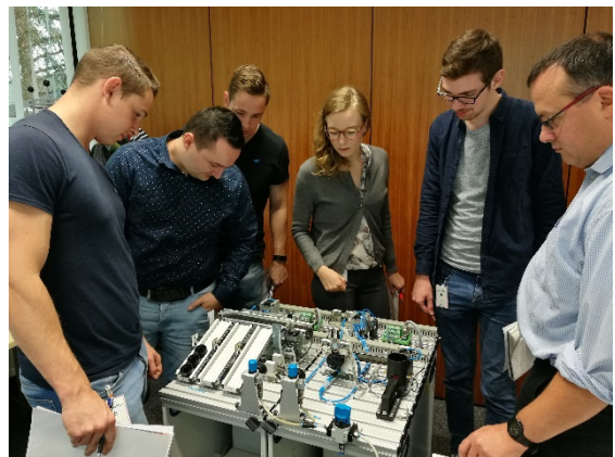
Pic. 4: Machine simulation, Day 3 (09.10.19)