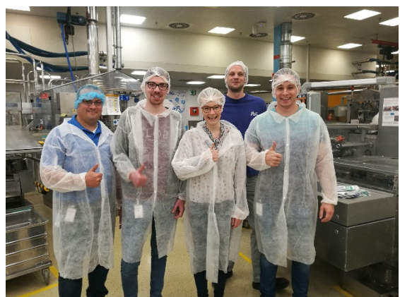
Pic. 6: Problem solved!, Day 4 (10.10.19)