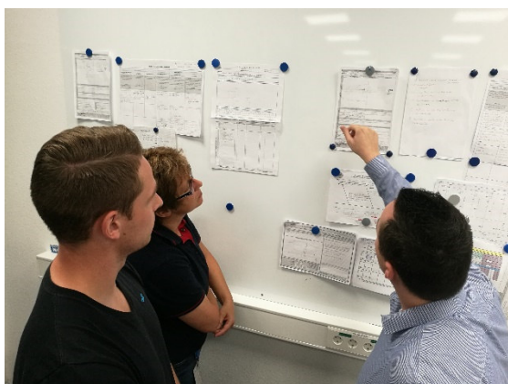
Pic. 5: Discussing results, Day 4 (10.10.19)