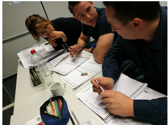
Pic. 2: Team meeting, Day 2 (08.10.19)